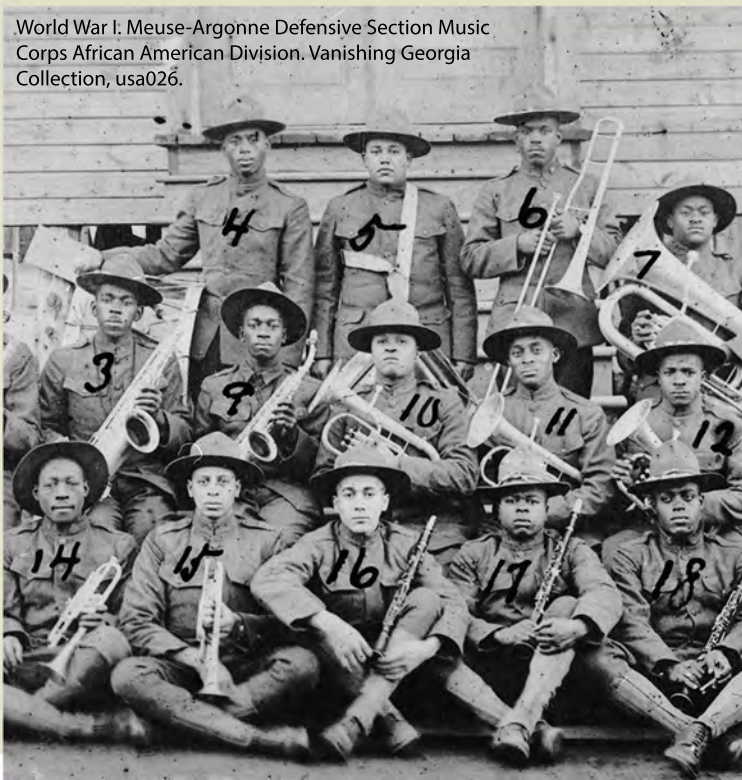
World War I. Meuse-Argonne Defensive Section Music Corps African American Division.

1:00 am – 4:00 pm Reference Library Orientation and Independent Research