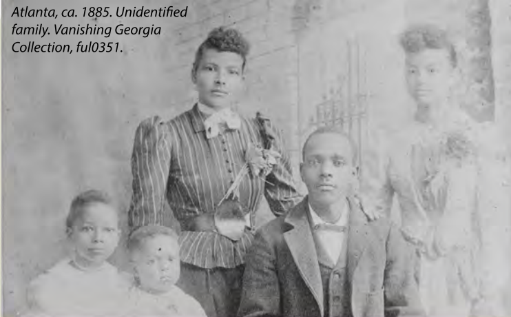
Atlanta, ca. 1885. Unidentified family.